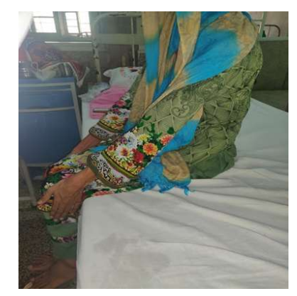
HRCT Chest: Apical Blebs

systemic disease and may involve multiple systems simultaneously, although occasionally the diagnosis of Marfan's syndrome can be delayed due to a lack of identifiable symptoms.<sup>5</sup> A few studies previously demonstrated respiratory complications in Marfan syndrome<sup>6</sup>, and it wasn't until recently that Karpman et al. further studied the link between pneumothorax and Marfan syndrome. The prevalence of pneumothorax in Marfan syndrome ranged between 4.8% and 11%<sup>7</sup> Although the frequency of apical blebs is relatively small in individuals with Marfan, the risk of pneumothorax is considerably increased in those with radiologically evident blebs or bullae.<sup>7</sup> Early recognition can help patient and the caregiver to provide the treatment accordingly. On account of first pneumothorax surgical treatment should be offered.<sup>8</sup> This patient presented with large pneumothorax which could be fatal and she was being treated as a case of Pulmonary Tuberculosis for the last 1 and a half year. Her CT scan revealed apical bleb which places her at higher risk of developing subsequent pneumothoraces. Our patient also had cardiac involvement and regular cardiac follow up is crucial as most of the times mortality is related to cardiac complications.