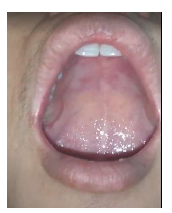
High Arched Palate