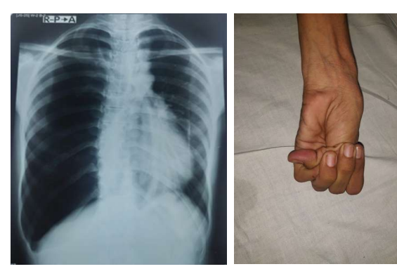
Right Sided Pneumothorax

Marfan syndrome affects roughly 1 in 10,000 to 15,000 people, according to estimates<sup>.4</sup> Marfan syndrome is a