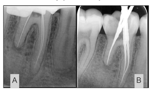
Figure 1 Intra-Operative Radiographs A) Working Length estimation B) Radiograph of Master Apical Files in canals